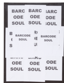
HYPER-POEM PAINTING (BARCODESOUL)

Graphite, paper, glue and acrylic on canvas